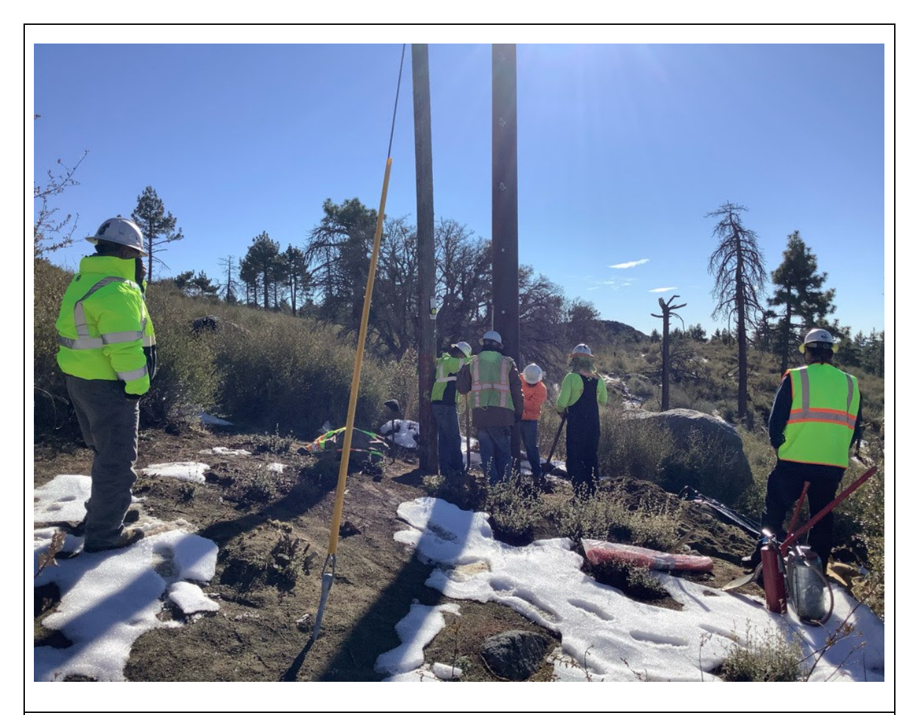
Photo 4: During preparations for pole removal along C 440, Archaeological and Cultural Monitors were observed monitoring digging activities in accordance with the HPMP, APM CUL-04, MM CUL-1, and MM CUL-3.