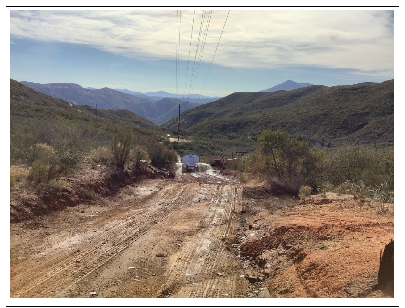
Photo 1: During access road maintenance along TL 6923, a water tender was observed applying water to the road to minimize dust emissions in accordance with APM AIR-02.