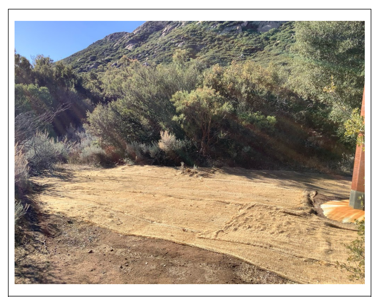
Photo 3: Jute netting at a restoration area, Pole Z40402 (TL 629A), was observed in good condition in accordance with MM BIO-4 and the HRP.