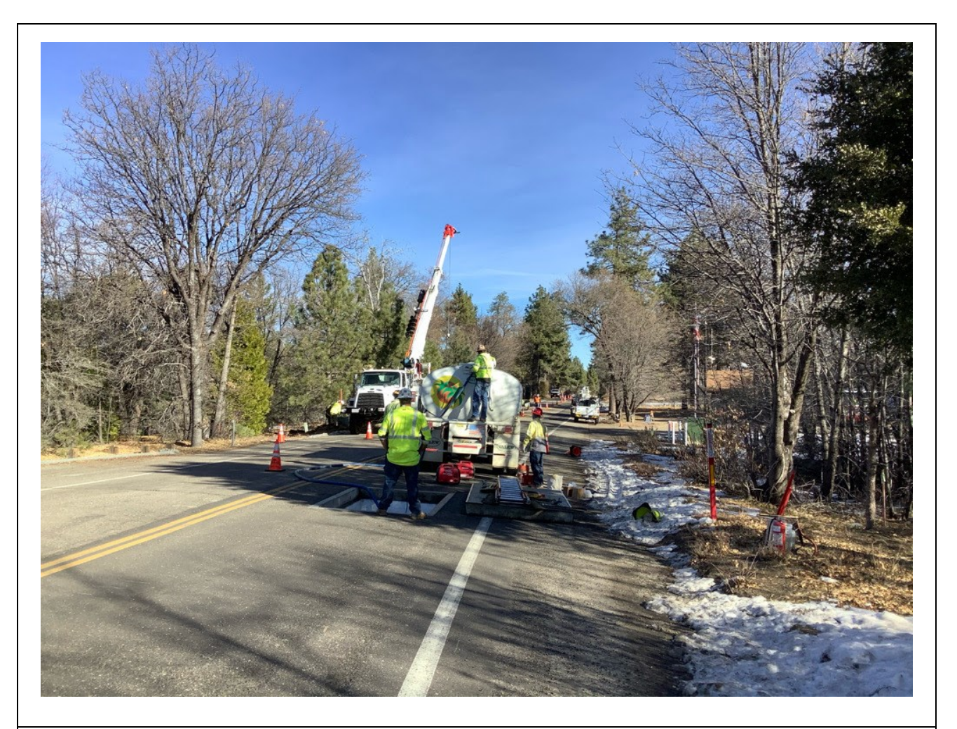
Photo 6: During dewatering activities on C 440, groundwater was pumped into a truck-mounted storage tank and transported to an authorized discharge location in accordance with APM HYD-08.