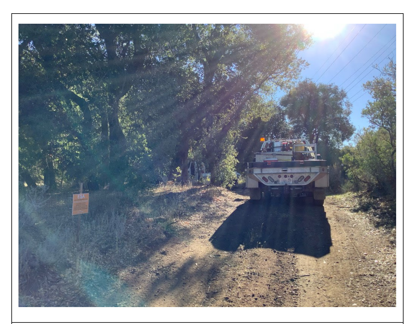
Photo 2: During gate repair activities near Pole Z40402 (TL 629A), project vehicles were observed on approved access roads in accordance with MM BIO-1. Additionally, signage was observed marking a special-status species ESA, which was observed being avoided by crews in accordance with MM BIO-14 and MM BIO-16.